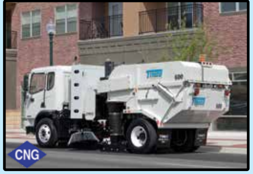
Autocar<sup>®</sup> CNG (Compressed Natural Gas)