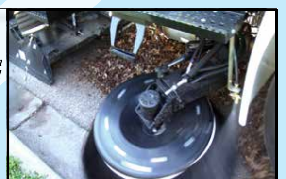
The TYMCO patented 43-inch Gutter Brooms are illuminated for night sweeping. The brooms can be equipped with optional Hydraulic Tilt Adjusters, Variable Speed Control and Drop Down options

The high-resolution touchscreen BlueLogic Display delivers on-board diagnostics for the sweeper and the auxiliary engine and provides valuable information including: hour meters, operational messages, service reminders for fluids and filters, event logs and sweeper statistics such as sweeping mileage and fuel and water usage.