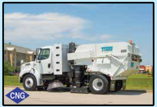
Freightliner<sup>®</sup> CNG (Compressed Natural Gas)

Sweeper photographs may contain optional equipment. Sweeper chassis models and options may change without notice. Consult your dealer or the factory.