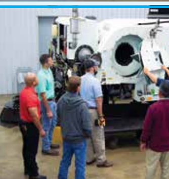
Attendees review components of the pick-up Instructor reviews proper maintenance, removal A Service School attendee receives her head assembly during removal and installation. and installation of the blower assembly.