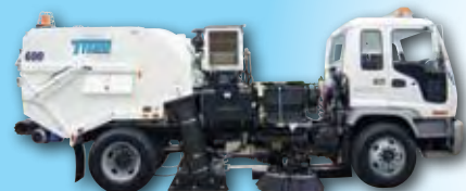
MODEL 600® Cabover Chassis