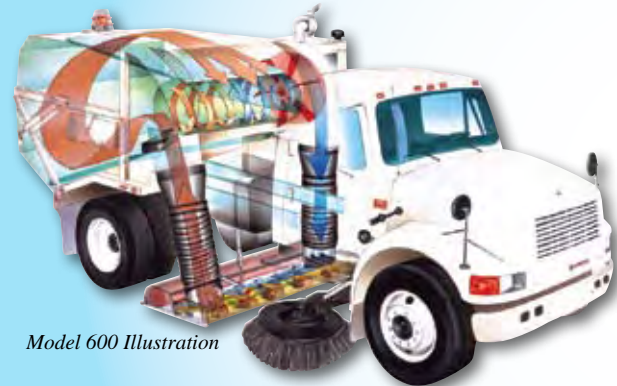
Model 600 Illustration

We want you to understand the Regenerative Air System and your TYMCO sweeper completely, so you can get optimal performance from your equipment investment. That's why, for more than twenty-five years, we've offered two-day scheduled training schools at our facility in Waco, Texas. Owners, managers, operators and mechanics get hands-on training and answers to specific questions. Enrollment levels are kept low, so you and your team will get personal attention as well as the opportunity to learn from the experiences of other attendees through the interaction of the class.