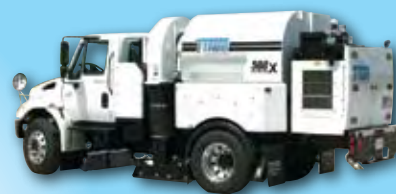
MODEL 500x® High Side Dump