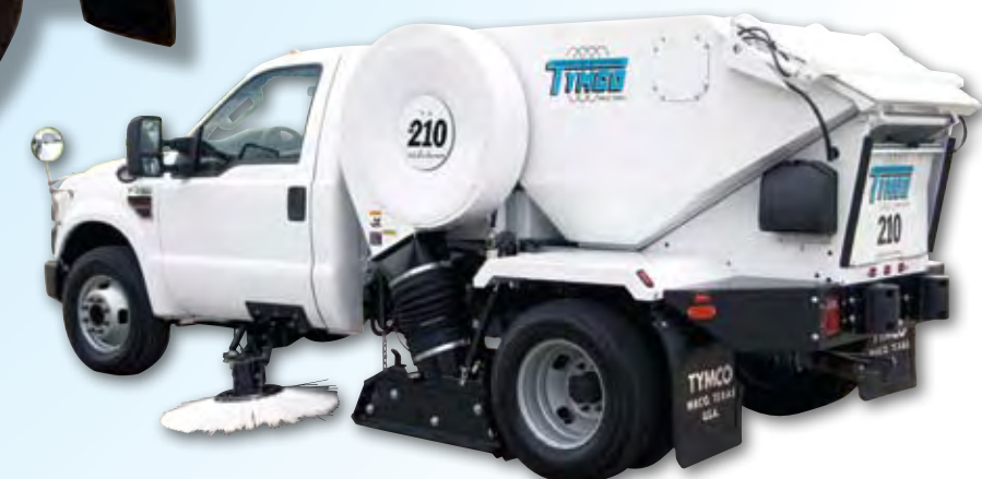
Model 210 ® Conventional Cab Chassis

Time-tested, heavy duty pick-up head propels a controlled jet of air through the blast orifice creating maximum pressure and powerful suction across the entire width of the pick-up head.