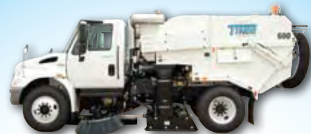
MODEL 600® Conventional Cab Chassis