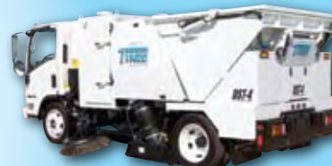
MODEL DST-4® Dustless Sweeping Technology