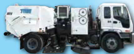
MODEL DST-6® Dustless Sweeping Technology