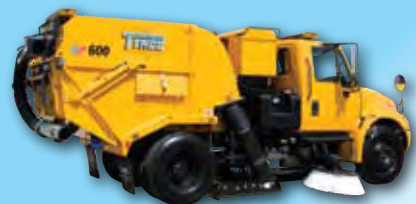
MODEL HSP® High Speed Performance for Airport Runways

Specifications subject to change without notice.