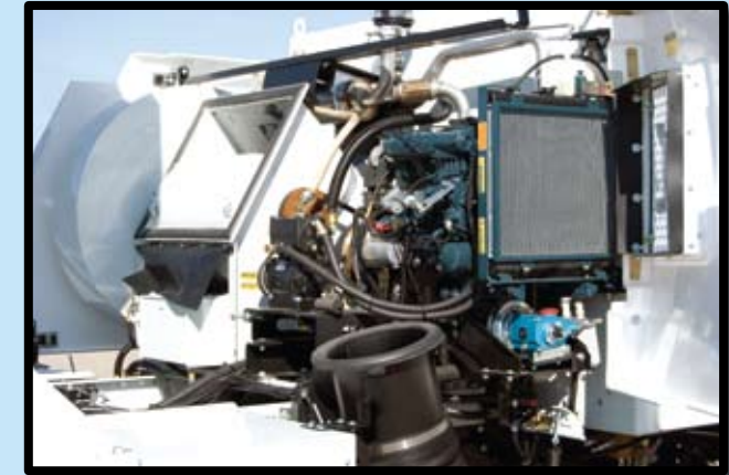
Locking side panels swing away for easy access to the auxiliary engine and blower housing.

Large hydraulically operated dump door allows for easy discharge and cleaning.