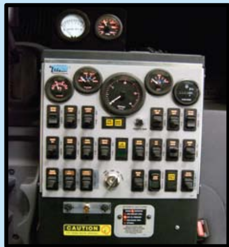
Operator friendly Sweeper Control Panel illuminates for easy night vision.

Heavy-duty Isuzu 17,950 lb. GVW chassis can be equipped with optional dual steering.