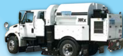
MODEL 500x® High Side Dump