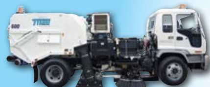
MODEL 600® Cabover Chassis