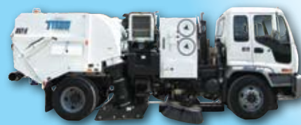
MODEL DST-6® Dustless Sweeping Technology