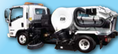
MODEL 210® Cabover Chassis

TYMCO REGENERATIVE AIR SWEEPERS are AQMD Rule 1186 Certified PM 10 -Efficient