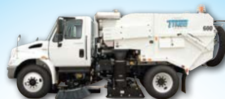
MODEL 600® Conventional Cab Chassis