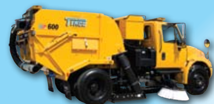
MODEL HSP® High Speed Performance for Airport Runways

Specifications subject to change without notice.