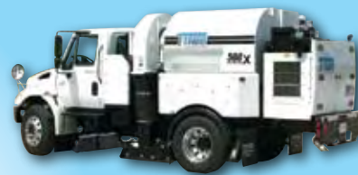
MODEL 500x® High Side Dump