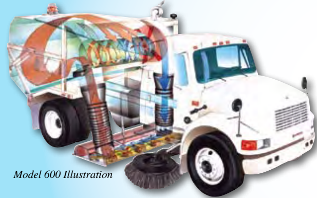
Model 600 Illustration

We want you to understand the Regenerative Air System and your TYMCO sweeper completely, so you can get optimal performance from your equipment investment. That's why, for more than twenty-five years, we've offered two-day scheduled training schools at our facility in Waco, Texas. Owners, managers, operators and mechanics get hands-on training and answers to specific questions. Enrollment levels are kept low, so you and your team will get personal attention as well as the opportunity to learn from the experiences of other attendees through the interaction of the class.