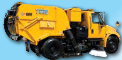
MODEL HSP® High Speed Performance for Airport Runways

Specifications subject to change without notice.