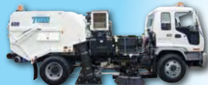
MODEL 600® Cabover Chassis