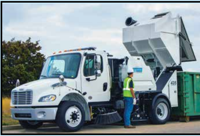
Dumping into a 30-yard Container