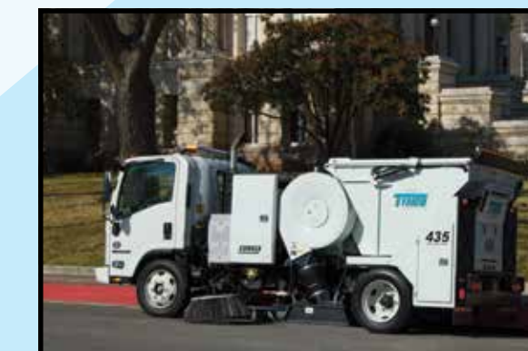
Isuzu® NPR-XD or NQR - 132.5 Inch Wheelbase Cabover Chassis