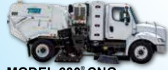
MODEL 600° CNG Compressed Natural Gas Powered