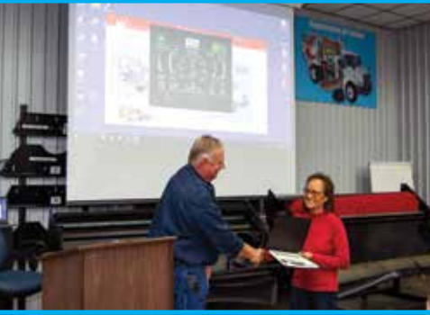
A Service School attendee receives her TYMCO Certificate of Completion.