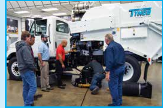
Attendees review components of the pick-up head assembly during removal and installation.

The 3500 square foot, temperature controlled TYMCO Training Center provides space for demonstrations on an operational sweeper and systems components.