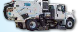
MODEL 600° COMDEX ® Street Sweeper