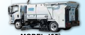
MODEL 435° Mid-Sized Street Sweeper