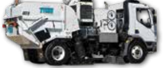
MODEL DST-6° Dustless Sweeping Technology