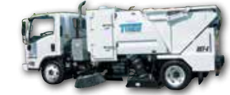
MODEL DST-4° Dustless Sweeping Technology