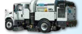
MODEL 500x° High Side Dump Street Sweeper