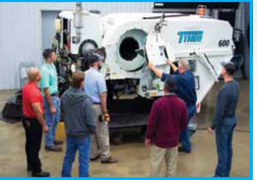
Instructor reviews proper maintenance, removal and installation of the blower assembly.