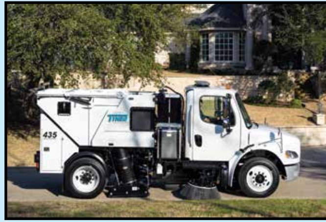
Sweeping Residential Areas