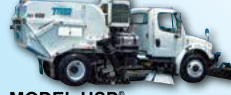
MODEL HSP ® High Speed Performance for Airport Runways Sweeper chassis models may change without notice.