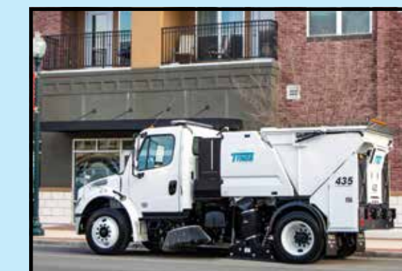
Freightliner® M2-106 - 153 Inch Wheelbase Conventional Cab Chassis