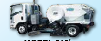
MODEL 210° Parking Lot Sweeper

TYMCO REGENERATIVE AIR SWEEPERS are South Coast AQMD Rule 1186 PM 10 Certified 0623 - 2M - 02SM © TYMCO, Inc. 2023