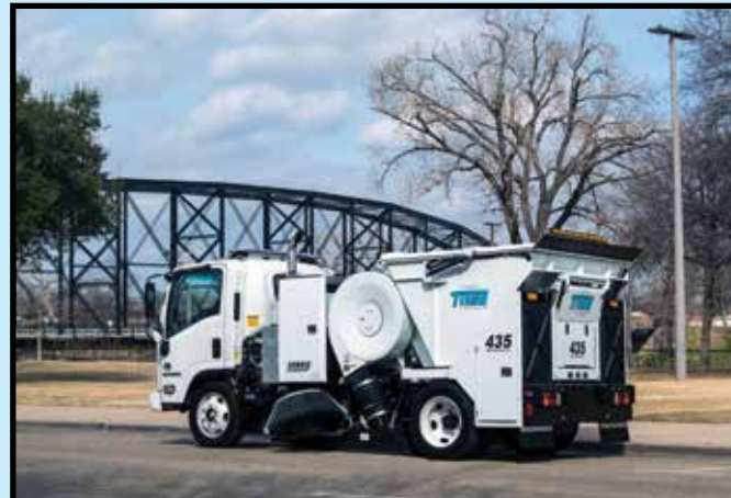
Sweeping Business Districts