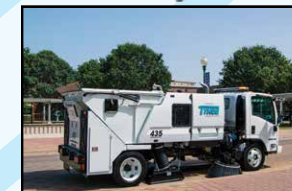
Isuzu® NQR - 150 Inch Wheelbase Cabover Chassis