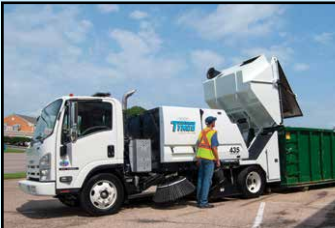
Dumping into a Low-Profile 30-yard Container